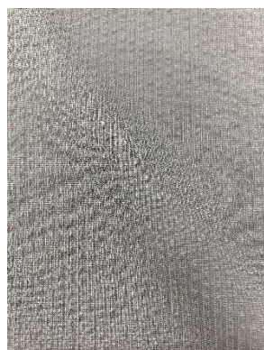
multifunctional and comfortable polyester material

This new product also offers sustainability benefits through the incorporation of recycled polyester in part. Its structure and elastic fibers provide stretch performance, while an uneven surface caused by differences in thread shrinkage and its structure avoid stickiness. Moreover, to achieve the combination of functions, Teijin Frontier also adopt special high-shrinkage technology and dying finishing technology. This material offers potential for use in both fashion and casual clothing.