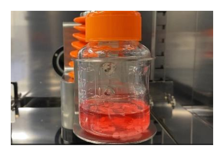
Shaking culture using the new nonwoven microcarriers

Another advantage of the new nonwoven microcarriers are their nonwoven high porous structure and therefore has a large surface area. This larger area allows more cells to be cultured than with conventional scaffolding materials. Teijin Frontier's research demonstrated that the new nonwoven microcarriers are possible to increase the number of cells by 30 percent in a culture period of four days, compared to conventional bead-type microcarriers.