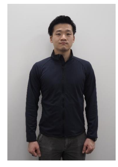
Sample product made with new self-adjusting knitted fabric

Teijin Frontier will market its new self-adjusting fabric as a core product for year-round sports and outdoor use beginning in fiscal 2023. Wide ranging of applications will include casual and functional apparel and uniforms as well as various materials. The company expects to target sales of 250 thousand meters in fiscal 2024.