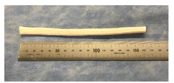
Starting biological tissue for artificial ligament

The Teijin-CTBE alliance is based on synergies in development fields, business strategies and proprietary technologies. CTBE will develop an artificial ligament derived from decellularized animal tissue for reconstruction surgery of knee anterior cruciate ligament (ACL), which connects the thighbone and shinbone, and seek approval for manufacturing and marketing, while Teijin will develop the technology for mass production with CTBE.