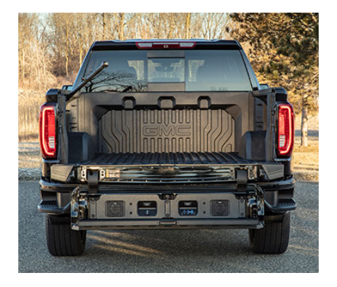
Teijin Group carbon fiber reinforced thermoplastic (CFRTP) products are used in General Motors pickup trucks.

We are currently facing unprecedented extreme climate change. Measures to reduce emissions of and absorb greenhouse gases, a cause of climate change, are essential as mitigation measures. The Teijin Group is working to mitigate climate change by providing high-performance materials and components to realize lightweight and electric mobility as a means of contributing to the reduction of CO<sub>2</sub> emissions and providing products that are essential to hydrogen-based social infrastructure with the aim of decarbonizing society.